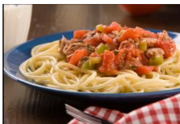
Add chopped bell peppers to your favorite pasta sauce.