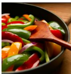
Add sautéed bell pepper slices to chicken dishes.